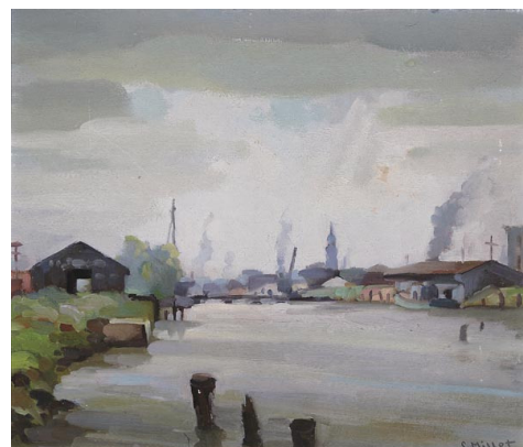
Lot 285 ▪ 12,925.00