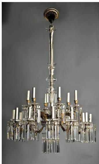
Lot 8 ▪ $12,000.00