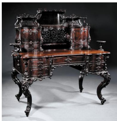
Lot 131 ▪ $12,337.00